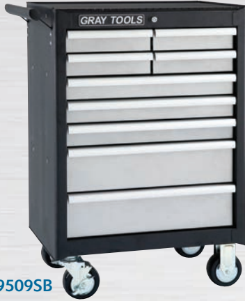
99509SB 9 Drawer Roller Cabinet - Marquis Series • 26½" x 18" x 39½" • Capacity: 9,157 cu. in. List $2,362.37 $1,322 95