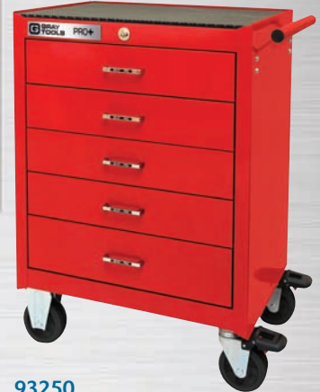
93250 5 Drawer Roller Cabinet - PRO+ Series • 26½" x 19" x 36" • Capacity: 9,316 cu. in. List $2,074.88 $1,161 95