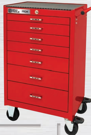
93270 7 Drawer Roller Cabinet - PRO+ Series • 26½" x 19" x 42" • Capacity: 11,512 cu. in. List $2,400.81 $1,344 95