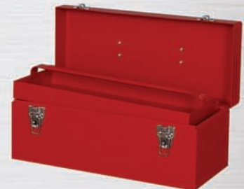
9107 16" Utility Box • 16" x 7" x 7½" • Capacity: 840 cu. in. List $123.45 $68 95