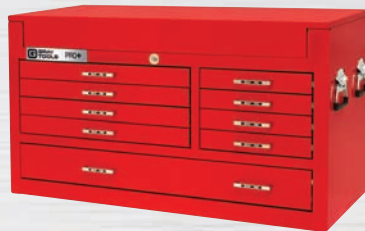
93119 9 Drawer Top Chest - PRO+ Series • 41½" x 18½" x 23½" • Capacity: 9,841 cu. in. List $2,494.15 $1,396 95