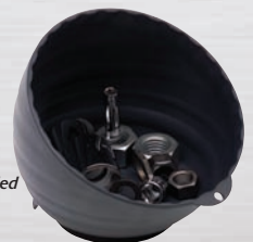
Parts not included

89923 Magnetic Parts Bowl • 6" Diameter List $43.01 $24 95