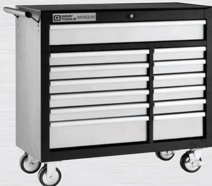
99213SB 13 Drawer Roller Cabinet - Marquis Series • 42" x 19" x 40" • Capacity: 13,677 cu. in. List $4,501.19 $2,519 95